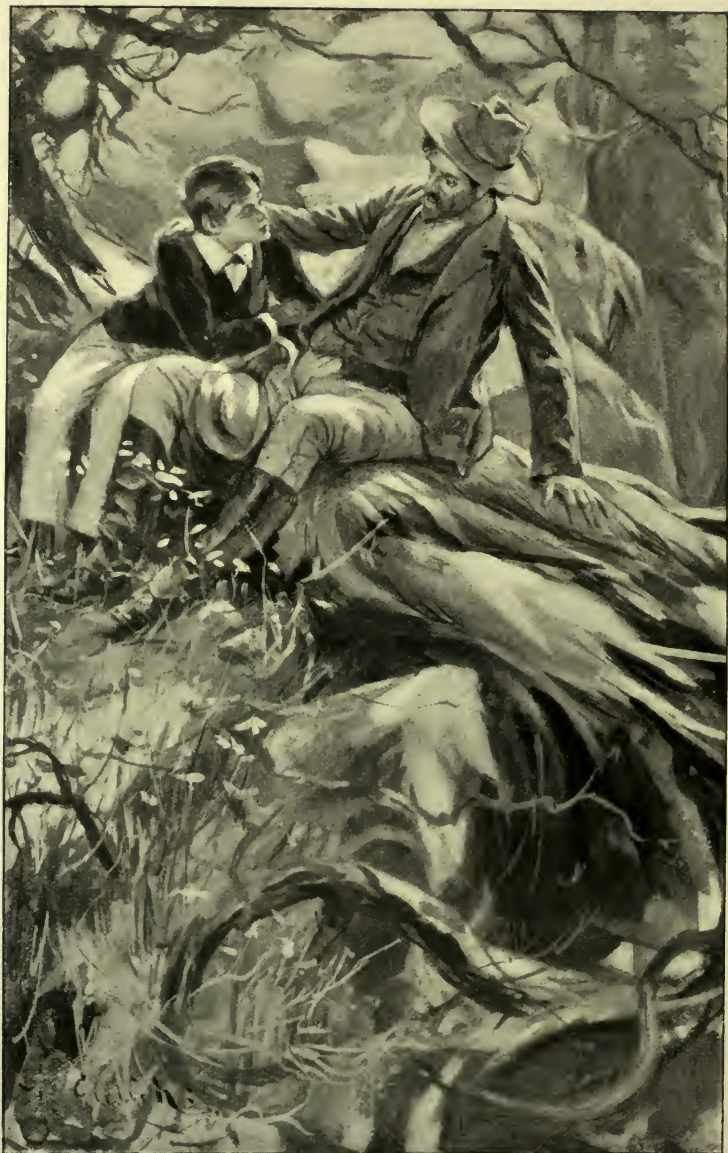
They sat, looking down upon the road.